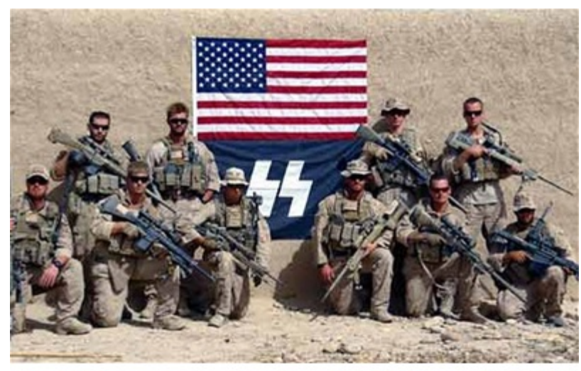
US Marines sniper unit posing with a US flag stacked with a Nazi SS bolt flag in Sangin, Afghanistan. (2012)

training for use in carrying out or participating in domestic terrorism or the prophesied "RaHoWa" (Racial Holy War), as well as a concerted effort on the part of white-supremacist and Nazi leaders to actively recruit within the ranks of the military, including specifically targeting veterans. This trend has intensified since the beginning of the US "War on Terror," which has created a significantly large pool of embattled soldiers and veterans returning to a bleak economic landscape caused by a prolonged economic downturn.