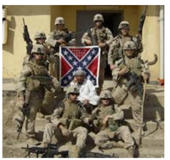
Soldiers of Kilo Company, 3rd Battalion 6th Regiment, 2nd Marine Division, posing with a Confederate flag in southern Afghanistan.